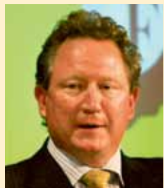
Andrew Forrest Mining entrepreneur and indigenous employment campaigner "Twiggy" Forrest is a mining entrepreneur from WA, presently the non-executive chairman and major