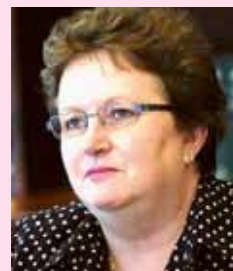
Amanda Vanstone Former federal minister & former Ambassador to Italy

Director of St James Ethics Centre since 1991 and serves on advisory boards, panels and committees of some of Australia's largest companies as well as serving on the board of the UN Global Compact's Principles in Social Investment.