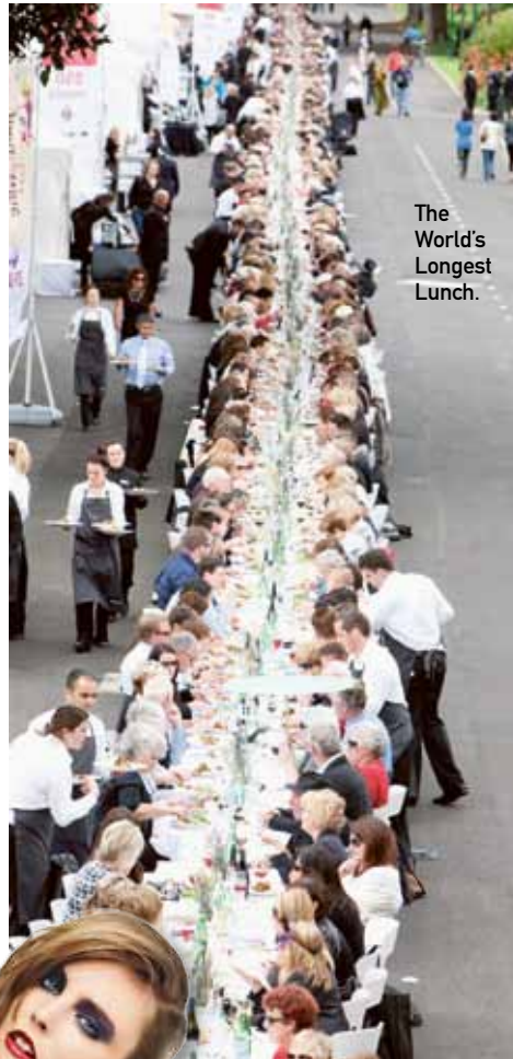
The World's Longest Lunch.

For sports lovers, there's plenty on offer including the Formula One Grand Prix at the picturesque Albert Park circuit (March 15-18), the Australian Cup at Flemington racecourse (March 10), one-day international cricket (March 2) with Australia up against Sri Lanka at the MCG and A-League soccer with Melbourne's Heart and Victory teams up against interstate rivals. The Super 15 rugby team Melbourne Rebels will also be in action at AAMI Park.