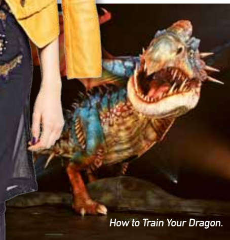
How to Train Your Dragon.