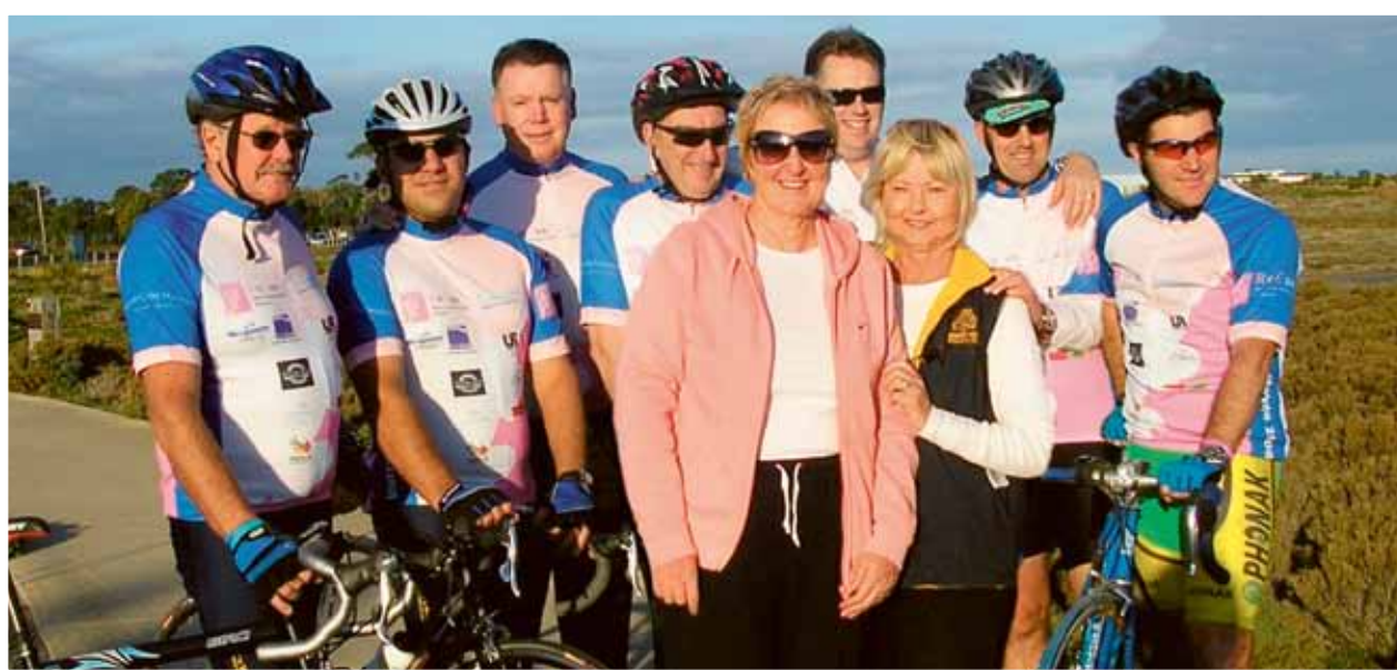
Every year dedicated Rotarians ride to the annual conference to raise money for research into Ovarian Cancer through Rotary's RoCan program. Next month 35 riders will undertake a challenging seven-day/900-kilometre ride through Victoria's High Country. Their goal is to raise more than $100,000 for ovarian cancer research to help find a screening test for ovarian cancer and to purchase chemotherapy treatment chairs for the Olivia Newton-John Cancer Wellness Centre. Donations can be made at www.mycause.com.au/mycause/raise_money/event.php?id=582