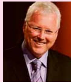
Tony Jones Host, Q & A and Lateline