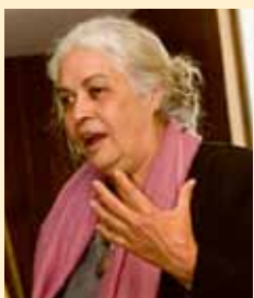
Professor Marcia Langton AM Leading indigenous scholar One of Australia's leading authorities on contemporary social issues in Aboriginal affairs, Marcia Langton was

shareholder (and formerly CEO) of Fortescue Metals Group. Previously named the richest man in Australia, Twiggy has been a dedicated campaigner for indigenous employment.