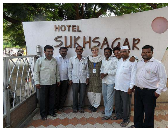
Some of the Malegaon team.