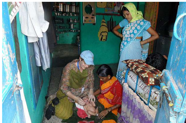
Vaccinating a newborn in my RDU cap

The RC Malegaon also invited me to the felicitation of some community members which was an honour. I actually spend far more time at some rotary clubs here than in my own district.