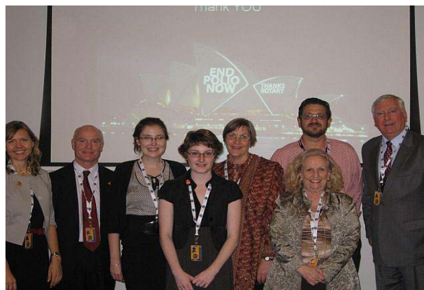
The Polio Eradication team from the UN Summit

It was nice to be home briefly in Sept to see my mom and to share our polio story at the UN Dept Public Information NGO Summit on Advancing Global Health in Melbourne. At this summit Rotary's workshop was titled "Coordination of a Public-Private Health Campaign- The Polio Eradication Initiative". The Summit gave us the opportunity to meet many other NGOs who are working to improve the lives of many around the globe and share ideas. It is always a privilege to share stories of the field battle towards polio eradication, it is an amazing program achieving much more than just our polio focus.