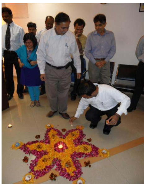
Lights around a rangola in the office

Time just flies when one is totally consumed in pursuing what they feel passionate about, it is hard to believe it is December already. The festivals have come and gone. Diwali - the festival of light - a time of thanksgiving for the harvest and having many traditions from India's mythology. At the office we lit lamps around a flower rangola (colourful mosaic on the floor)) then all joined for a meal together. The light of the lamp symbolising peace and harmony. The festival was an incredible experience, we had several nights of fireworks, shopping and celebrating with family.