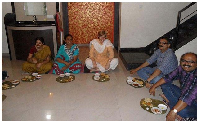
Sharing dinner & Durga Puja RC Malegaon Midtown

Since my return, we have been full on into preparations and implementation of campaigns, so days have been long and I usually crash before dinner at 2200 hours. My home in Malegaon is great, a small hotel where our entire team stay. They have a veg restaurant and really cater to our needs (early mornings and late nights). They know I love spices so my food is usually packed with chilli. The President of Rotary Club of Malegaon Mid Town invited me to join their meeting for the DGs visit which was nice. The meeting was in Marathi (language), - it is really interesting to be introduced prior to speaking and not understand one word that was being said!