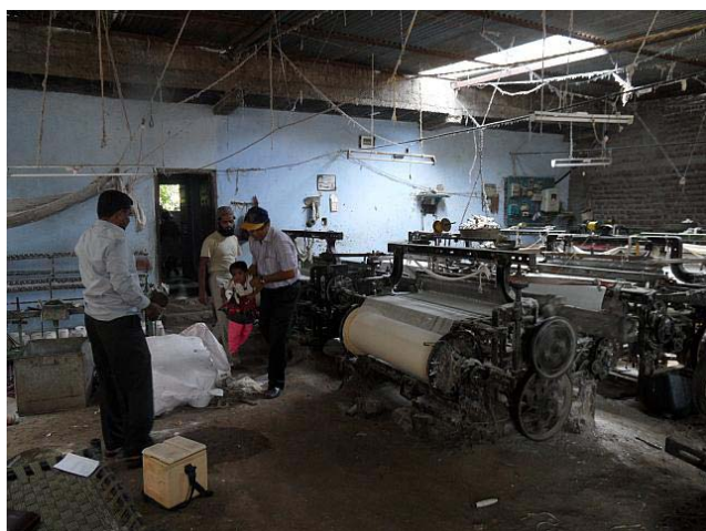
Immunizing in a power loom

languages are Marathi, Urdu, Hindi and to a lesser degree English. The city has grown around its textile industry and is famous for its power looms. The noise of these looms is deafening, but they are the character of Malegaon, as is the lack of infrastructure to support the population. Many areas lack the basics of drinking water and sanitation; this contributing to the persistence of polio virus in the area. I was truly happy to be posted here.