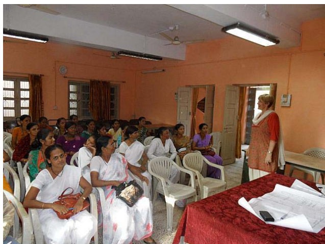
Training supervisors in Malegaon