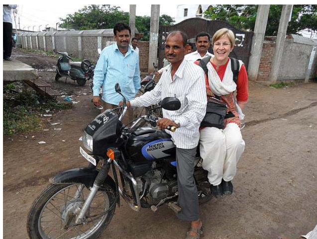
Transport to town

It is truly a honour to be serving with polio eradication, to walk alongside so many in this program, to live in another culture, to and to meet those most needy in our community.