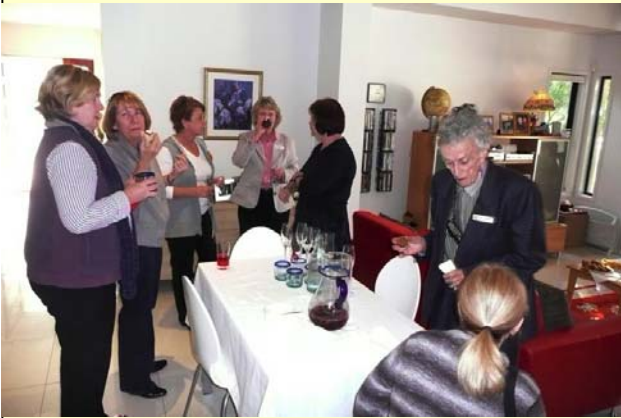
Coffee, cakes and conversation