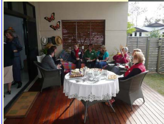
Calm before the food!!!!!!!