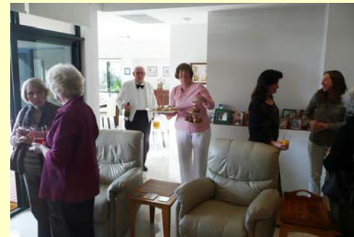
The hostess launching the afternoon nibbles