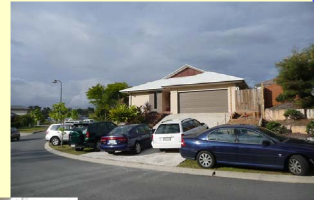
Parking Attendant's heaven