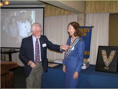
The passing of the authority of office