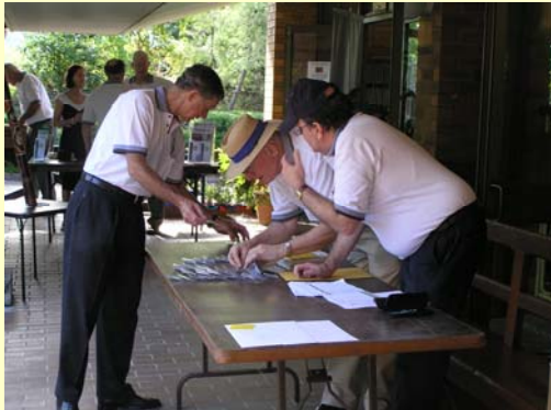
Many hands make light work