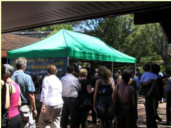
Morning Tea after the ceremony