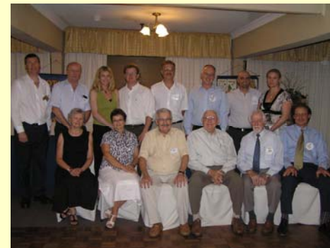
All the new members, partners and sponsors