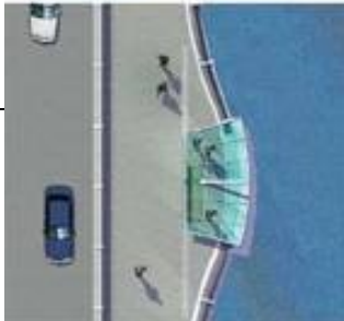
The Gateway Bridge cyclists will have a panoramic view from their own crest lay-by