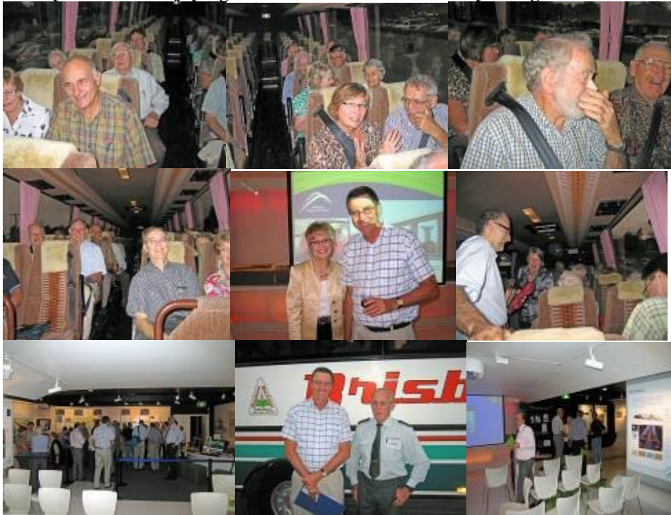
Photos 5 & 8 - who likes both ways? Photos 3 & 6 - whose nose needs covering?