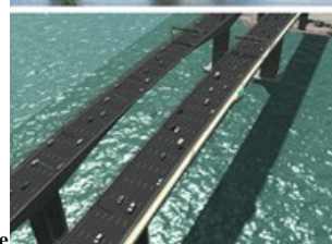
The Gateway Bridge