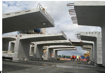
The Gateway Bridge under construction